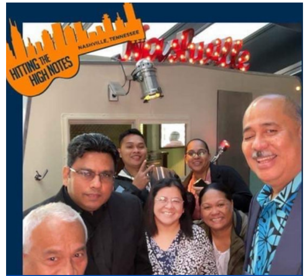
COM-FSM with a few NERAOC Participants

This conference had been administered by NIFA staff, breaking the conference down to 9 sessions in total excluding breakfast meetings, guest speaker experience and museum visits. In this conference, presenters were able to provide information about their own experiences to the audience. Their presentations were basically displaying issues that their universities had faced, and the solutions that they've formulated. Some of the sessions were more interactive than the others, for instance,