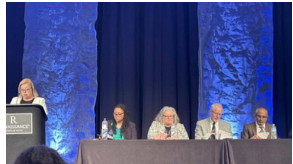
NERAOC Participants Plenary