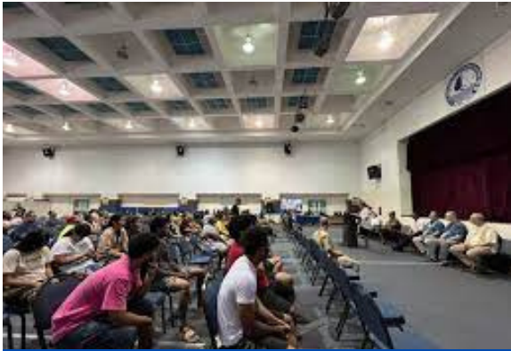
Accreditation Team Plenary