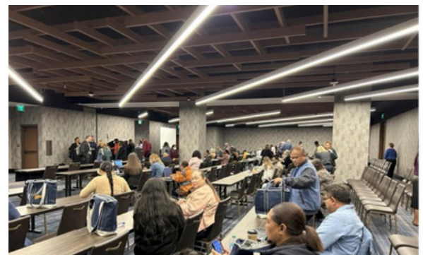
NERAOC Participants while on break