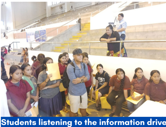
Students listening to the information drive