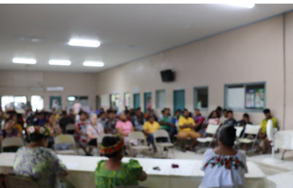
Students, Faculty, & Staff at CTEC Student Hall